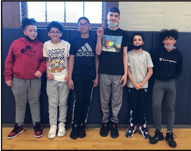
2021 Dodgeball Champions