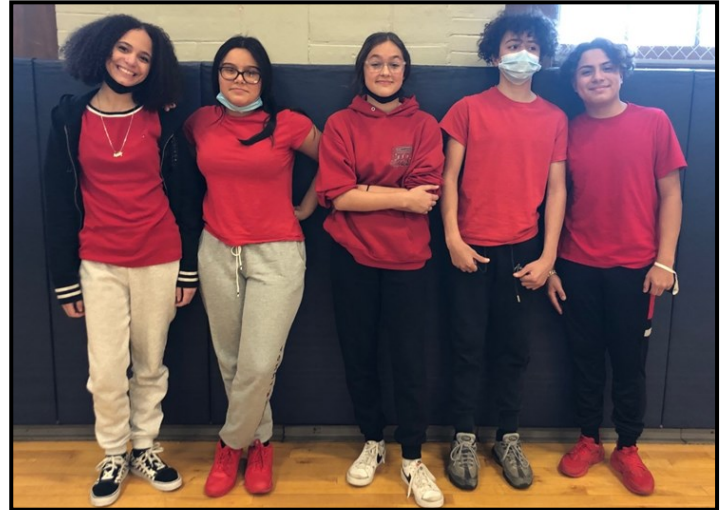
2021 Dodgeball Best-dressed