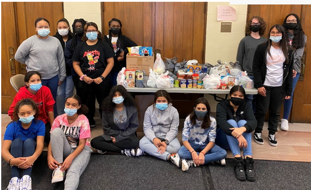
Members of the HEMS Student Council and the HEMS girls' basketball team recently collected nonperishable goods for United Charities.